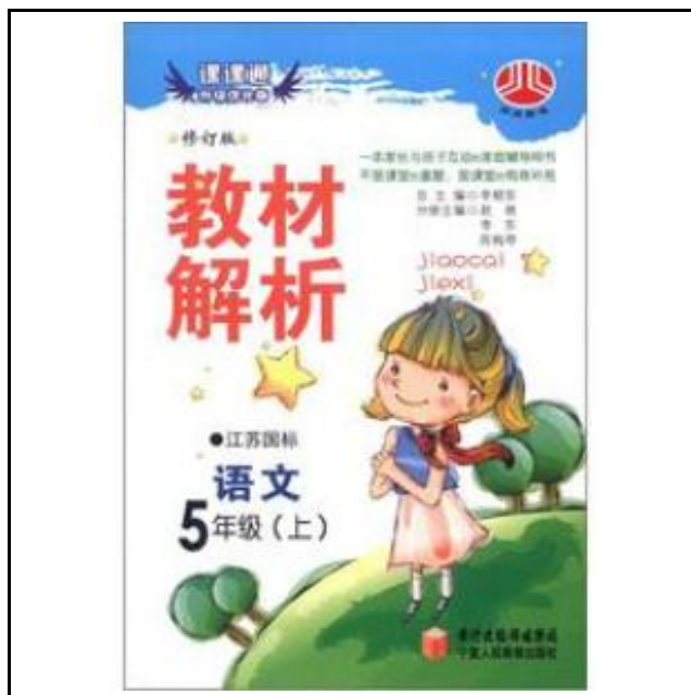
Filesize: 8.74 MB